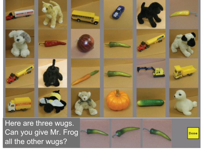
Fig. 2. Examples of the experimental display when a single exemplar was presented (left) and when three subordinate-level exemplars were presented (right). Exemplars were presented in the lower portion of the screen and described by a nonsense word (e.g., "wug"). Participants were instructed to select objects similar to the exemplar from the 24-item generalization set shown above. They clicked the "Done" button after they selected the matches on each trial. The selected items were highlighted by a green box (not shown).